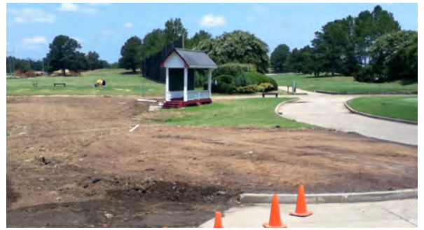
Depth of the range increased by nearly 100 yds, extending into #18 and closer to the clubhouse

Driving range lights were added once the teeing area renovation was completed. Extended hours are now offered in the spring, summer, and fall beyond sunset for the dedicated players who just can't leave the magical grounds of the MSU Golf Course.