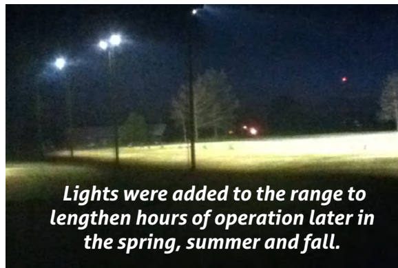
Lights were added to the range to lengthen hours of operation later in the spring, summer and fall.

Driving range lights were added once the teeing area renovation was completed. Extended hours are now offered in the spring, summer, and fall beyond sunset for the dedicated players who just can't leave the magical grounds of the MSU Golf Course.