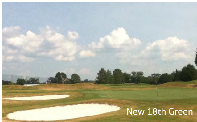
New 18th Green

The changes to the driving range affected other areas of the facility, including holes 10 and 18. To accommodate the desired updates, #10 was turned into a short, 120 yard par 3, and #18 was shortened by roughly 120 yards, and now plays as a very inviting 535 yard par 5.